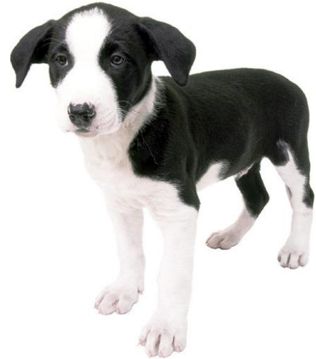
Table foods are not recommended. Because they are generally very tasty, dogs will often begin to hold out for these and not eat their well-balanced dog food. If you choose to give your puppy table food, be sure that at least 90% of its diet is good quality commercial puppy food.

Semi-moist and canned foods are also acceptable. However, both are considerably more expensive than dry food. They often are more appealing to the dog's taste; however, they are not more nutritious. If you feed a very tasty food, you are running the risk of creating a dog with a finicky appetite. In addition, the semi-moist foods are high in sugar.